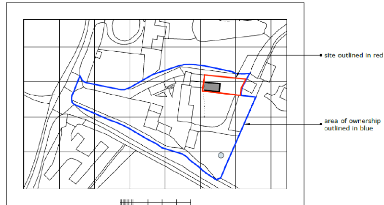
LOCATION PLAN 1/1250