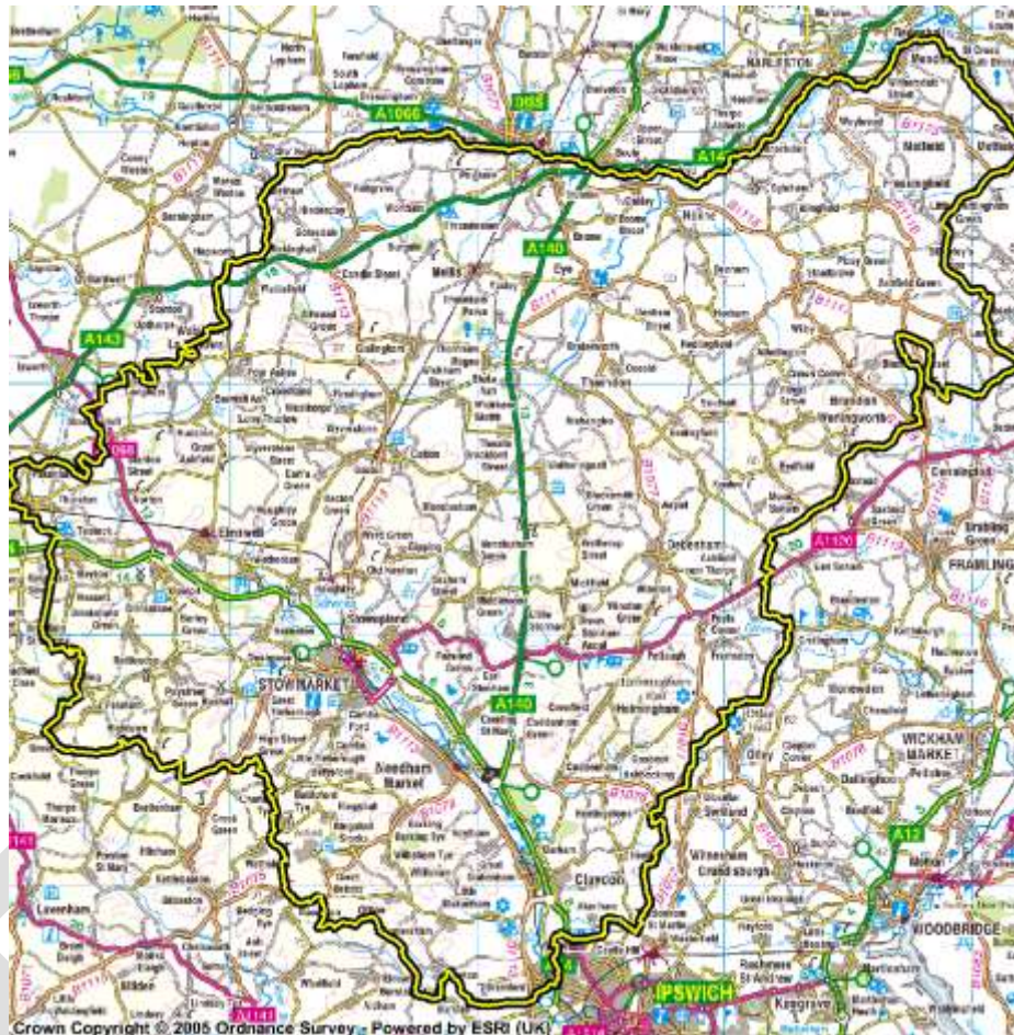
Map of Mid Suffolk District

The main gambling activities noted in the district since implementation of the Gambling Act 2005 are licensed off-course betting, gaming in alcohol licensed premises and members clubs (in the form of gaming machines, exempt and prescribed gaming), non-commercial gaming and small society lottery registrations.